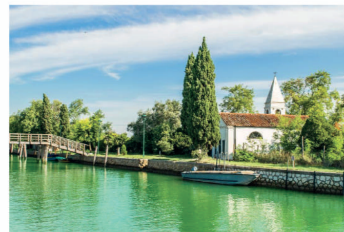
Vignole is an island not far from Murano in Venice. It is home to vineyards that are part of the ... [+]