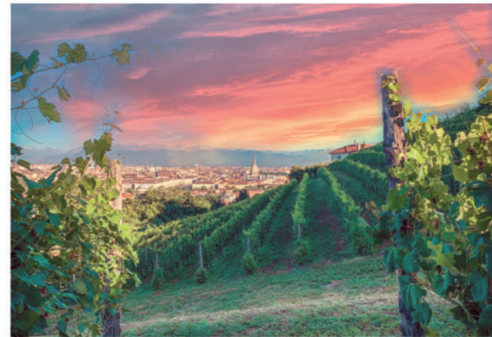
The Vigna della Regina vineyard overlooking Turin.

As a country with a notably diverse landscape, Italy offers vineyards in locations ranging from the gently rolling hills of the Chianti and gravity-defying terrain of the Cinque Terre to Mt. Etna's dramatic slopes and the Alpine turf of Aosta and Alto Adige. But the most unexpected place to find a vineyard in Italy may well be within the confines of one of its famous cities.