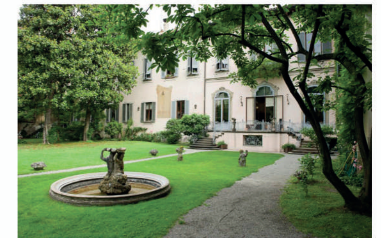
The 15th-century Casa Atellani in Milan, once home to Leonardo da Vinci, where he maintained a ... [+]

In addition to the Vigna della Regina in Turin, Urban Vineyard Association members in Italy include: Venice's Vineyards in the Lagoon , managed by the Laguna nel Bicchieri Association , and San Francesco della Vigna ; Siena's Senarum Vinea ; Milan's La Vigna di Leonardo ; Palermo's Vigna del Gallo . (In France, Clos Montmartre in Paris and Lyon's République des Canuts are part of the U.V.A.)