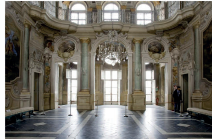
The interior of the Villa della Regina.