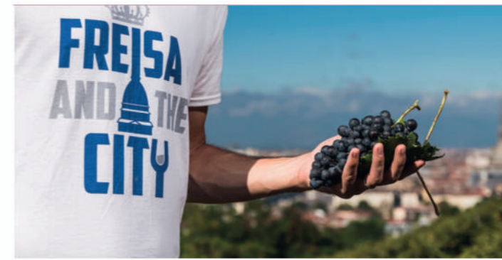
The Freisa grape.